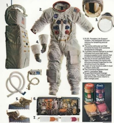
Tang. For spacemen and earth families.