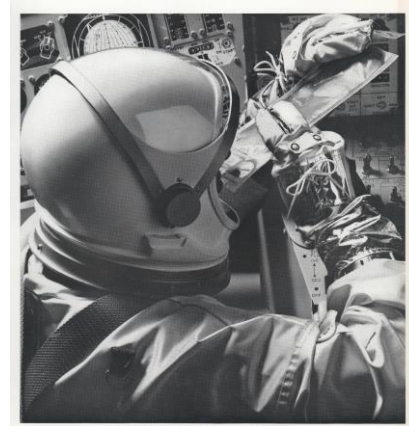
The Gemini Astronauts drank Tang...like this. You can drink it from a glass.

Tang sponsors TV coverage of America's first manned flight around the moon, Apollo 8.